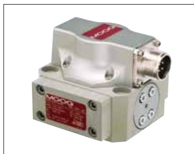
G761 / 761