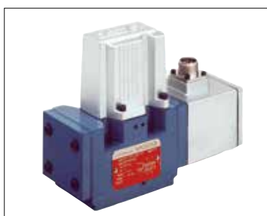
D661, D662, D663, D664, D665