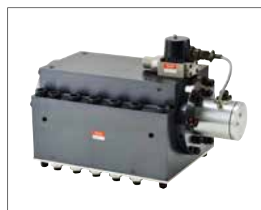
J790-200, J790-400, J790-600