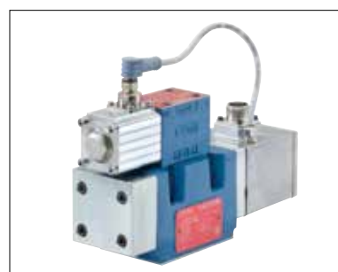
D681, D682, D683, D684, D685