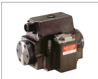
J072 / 072