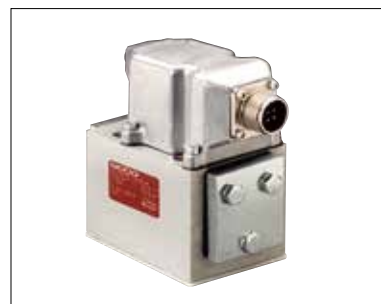
G631 / 631